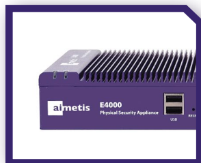
E4000 Install up to 32 cameras