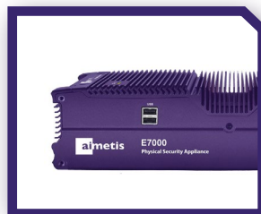
E7000 Install up to 24 cameras